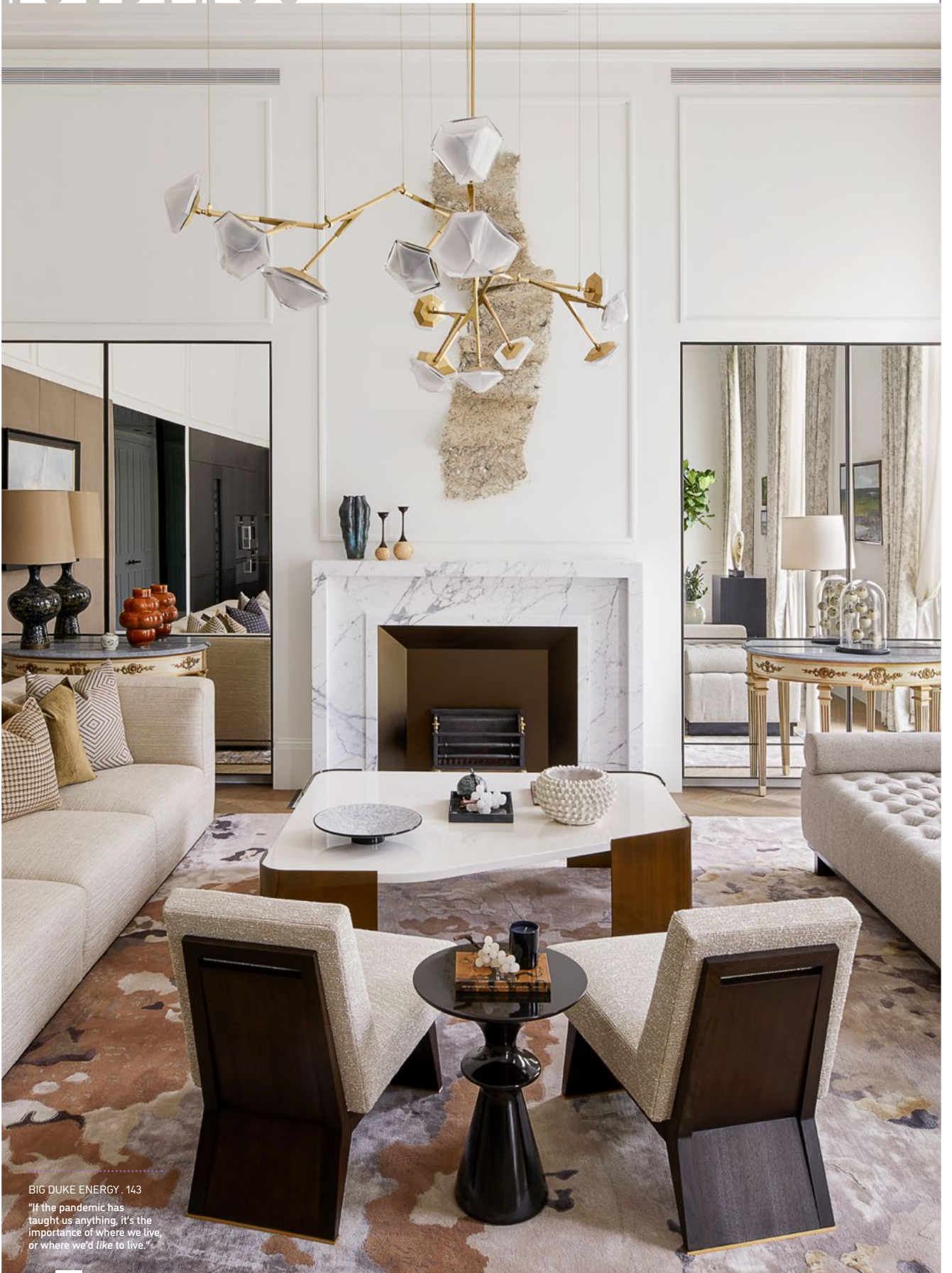
BIG DUKE ENERGY . 143

"If the pandemic has taught us anything, it's the importance of where we live, or where we'd like to live."